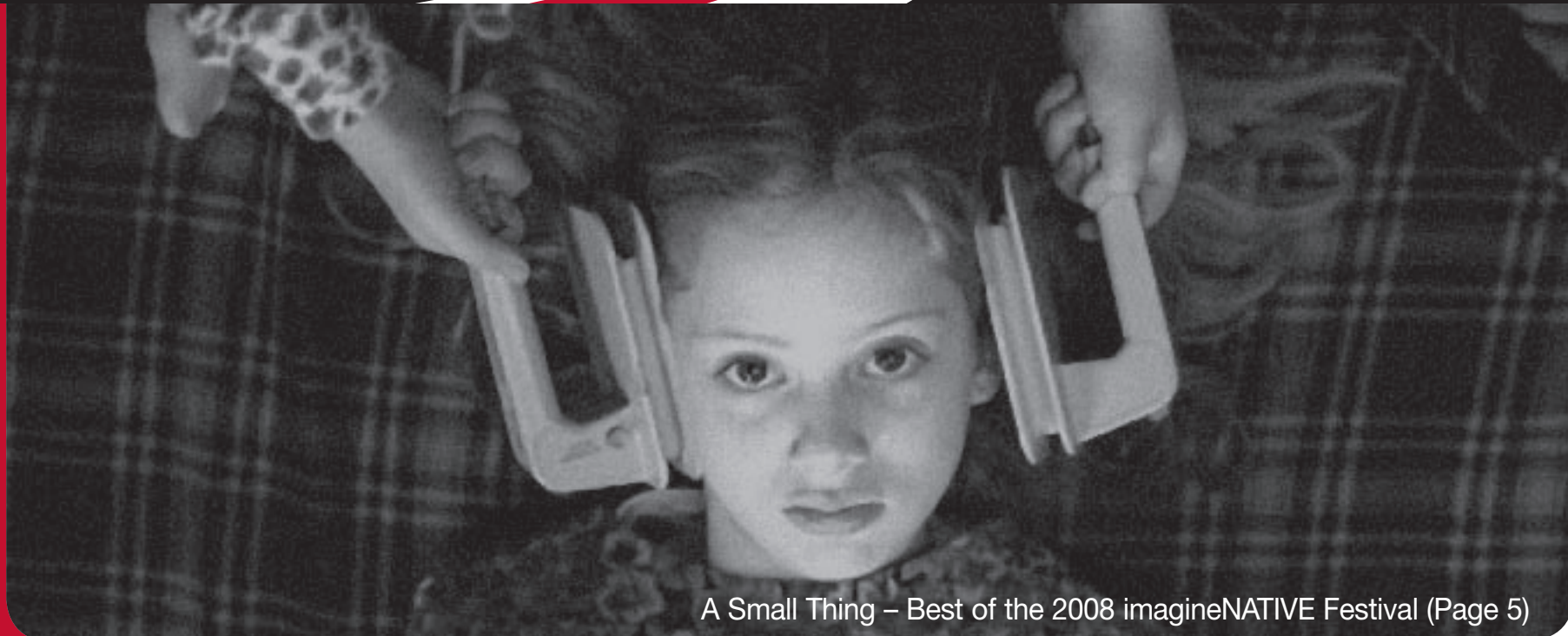
A Small Thing – Best of the 2008 imagineNATIVE Festival (Page 5)