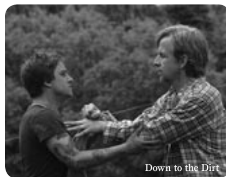
Down to the Dirt

*WINNER BEST ATLANTIC FEATURE / 2008 Atlantic Film Festival