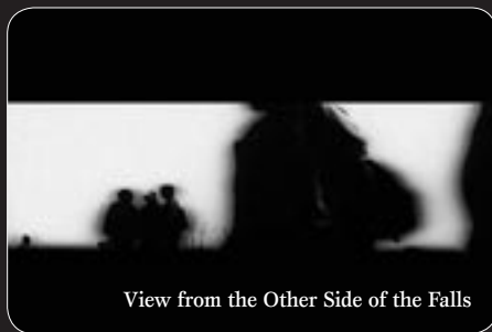
View from the Other Side of the Falls