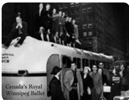
Canada's Royal Winnipeg Ballet

"A must-see - it recounts how a fragile dance group from the Prairies survived challenge and misfortune to become one of the world's premier ballet companies." (GLOBE AND MAIL)