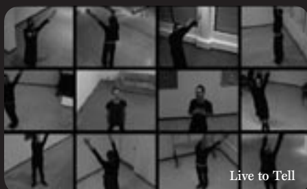
Live to Tell

This artist had two perfect years and has been working to relearn the stroke ever since. Here he channels Madonna into a multi-screen surveillance video, casually janitor dancing in between a capella turns. The singing is so beautiful, so calculatingly off-hand, so heartfelt in an emo, shoegazy sort of way, that even Madonna didn't have the heart to sue him.