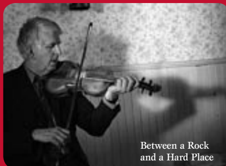
Between a Rock and a Hard Place