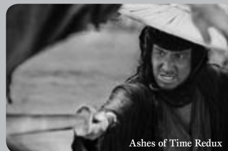
Ashes of Time Redux

The original ASHES OF TIME has a mythical reputation among Wong Kar Wai aficionados. A masterpiece rarely seen in the West, it is also the director's one and only martial arts film. But it left audiences baffled, as they had expected a more traditional wuxia movie. Instead, ASHES OF TIME was, and remains, the most abstract of Wong's work, a poetic reverie on unrequited love and memory... In ASHES OF TIME REDUX, Wong has streamlined the narrative without losing the essence of the original work. (Toronto International Film Festival)