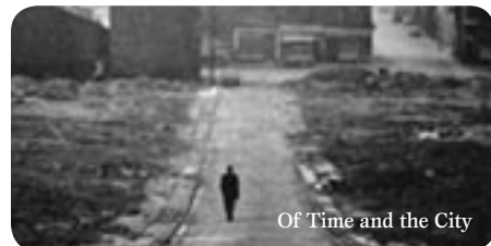
Of Time and the City

■ Wednesday & Thursday, Feb. 25 & 26 • 7:00 PM • Saturday, Feb. 28 • 9:30 PM • Sunday, March 1st • 4:30 PM