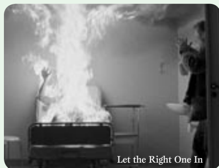
Let the Right One In

"LET THE RIGHT ONE IN not only re-energizes vampire cinema, this is one of the best pictures of 2008." (Brian Orndorf)