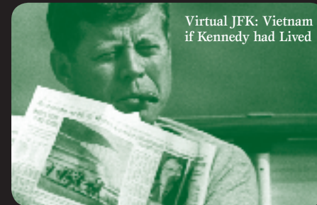
Virtual JFK: Vietnam if Kennedy had Lived

" VIRTUAL JFK ponders the mystery of the Kennedy personality mainly as manifested during his televised press conferences – radiating star power, the coolest man in the room disarms adoring tweedy reporters with his dry martini wit... Masutani's no-frills, largely black-and-white production is as evocative of early-'60s masculine styles as any episode of Mad Men ." (J. Hoberman, The Village Voice )