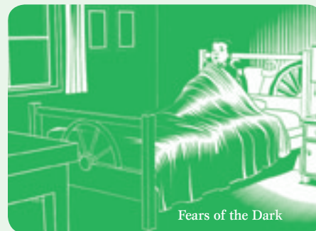
Fears of the Dark