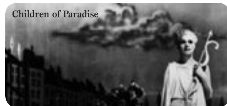
Children of Paradise

Amazingly, the film was produced over a two-year period in virtual secrecy, without the knowledge of the Nazis then occupying France, who would surely