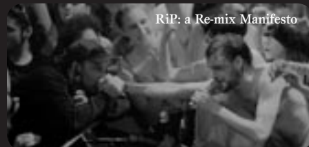
RI P: a Re-mix Manifesto

"A knockout. RI P is a dazzling frontal assault on how corporate culture is using copyright law to muzzle freedom of expression." (MacLean's)