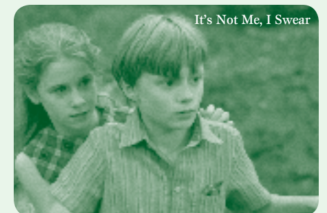
It's Not Me, I Swear

Jury Award: "Original, funny, provocative, and deeply moving."